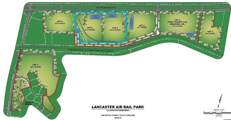
LANCASTER AIR RAIL PARK ILLUSTRATIVE RENDERING LANCASTER COUNTY, SOUTH CAROLINA 2020.11