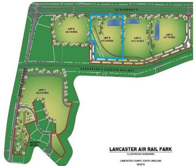
LANCASTER AIR RAIL PARK ILLUSTRATIVE RENDERINGS LANCASTER COUNTY, SOUTH CAROLINA 062413